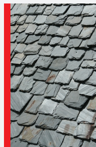
SLATE ROOF TILES

For more detail and specifications related to this product, please refer to the technical data sheet (TDS) in-person or online.